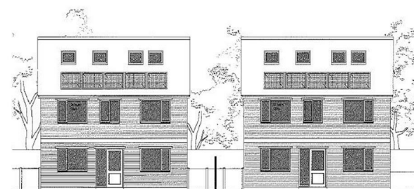
Proposed Front Elevations