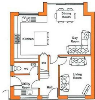
Proposed Ground Floor