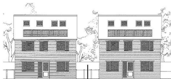
Proposed Front Elevations