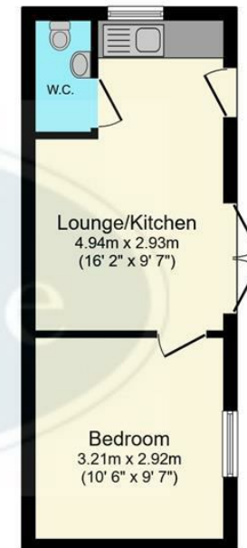
Annexe Floor area 24.8 sq.m. (266 sq.ft.)

Total floor area: 113.0 sq.m. (1,217 sq.ft.)