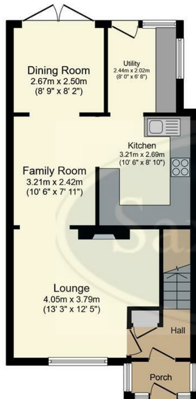
Ground Floor Floor area 51.2 sq.m. (552 sq.ft.)