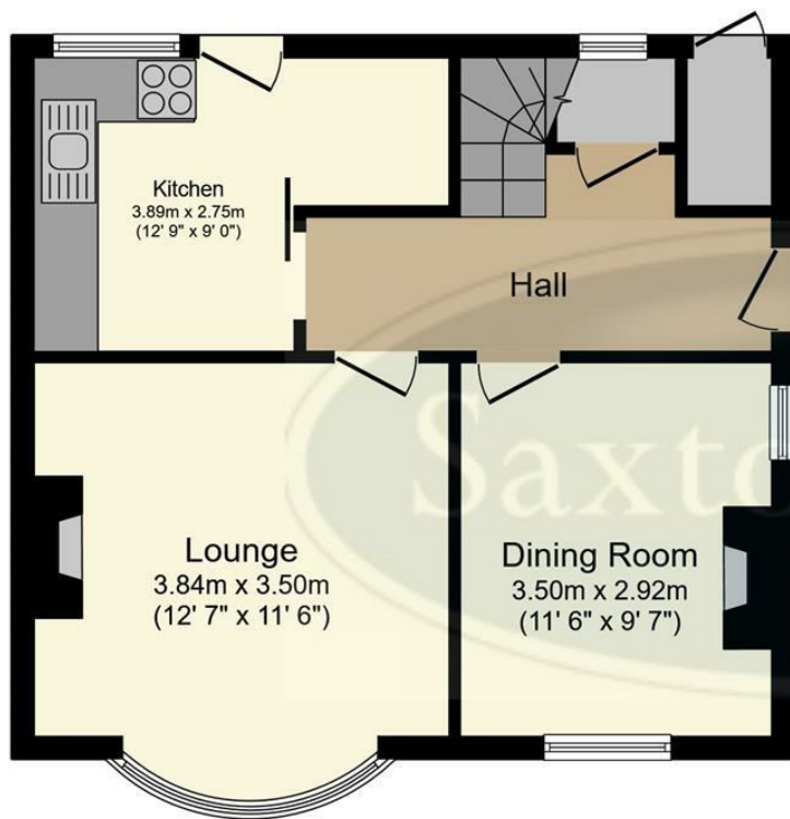
Ground Floor Floor area 45.0 sq.m. (484 sq.ft.)