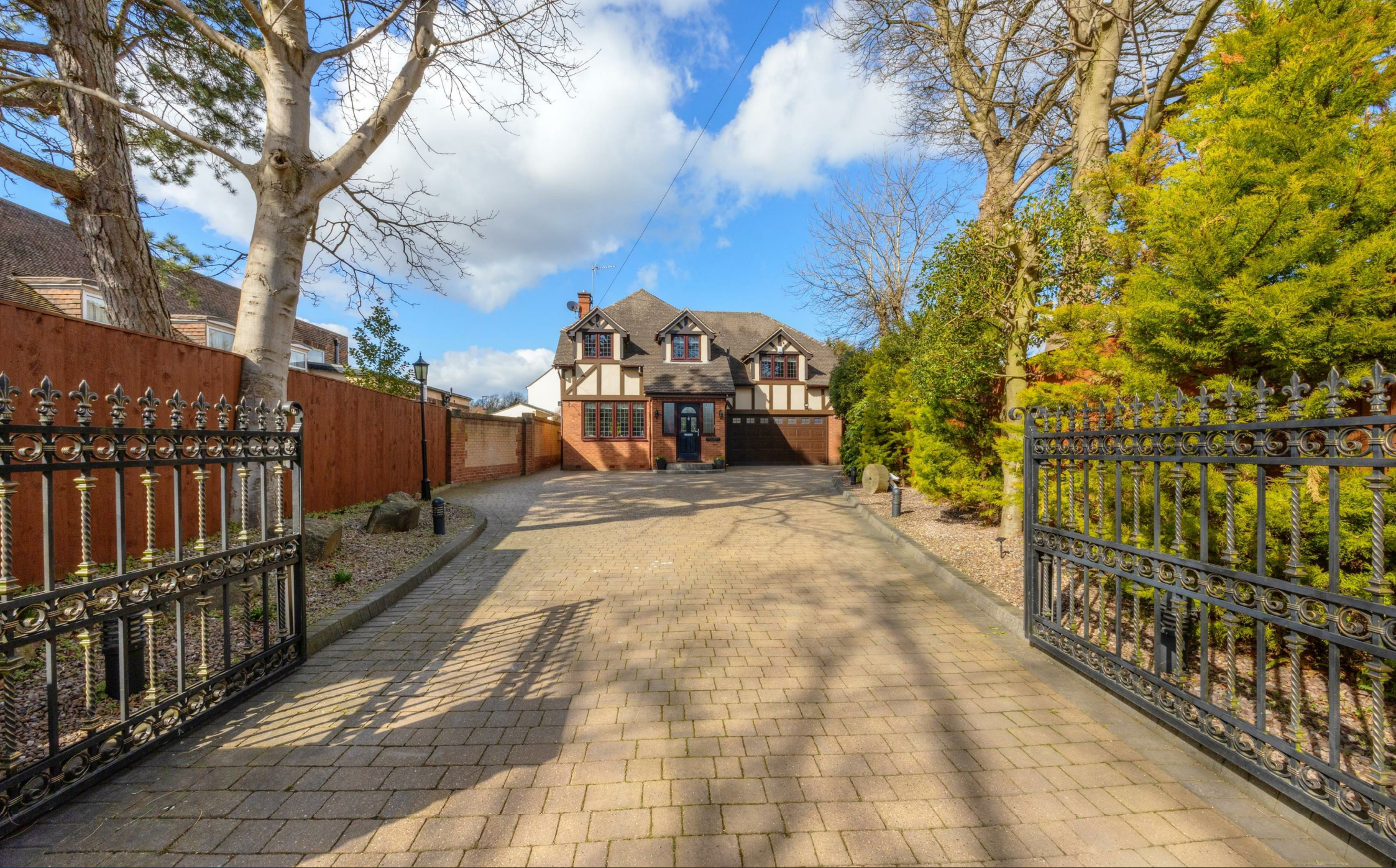
Christchurch Cottage Townhead Road, Dore, Sheffield, S17 3GA