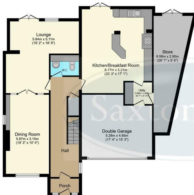
Ground Floor Floor area 137.6 sq.m. (1,481 sq.ft.)