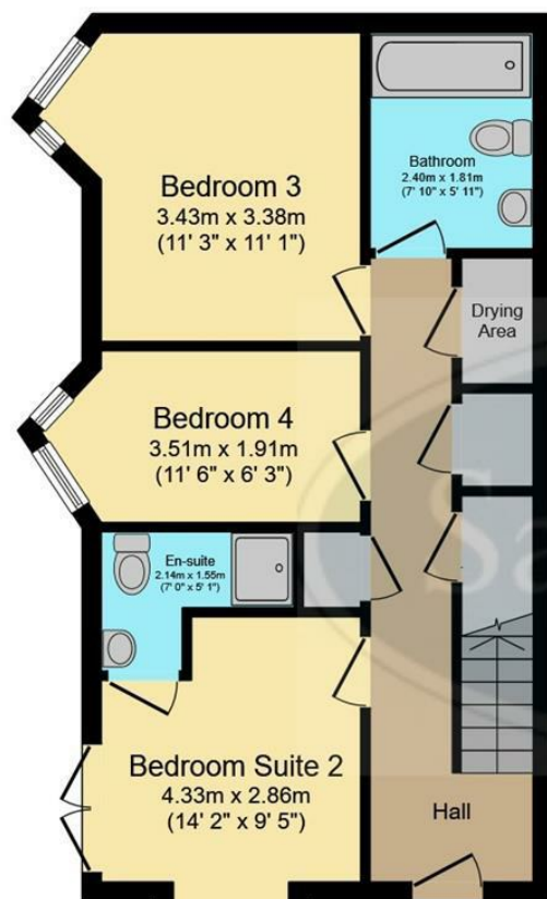
Ground Floor Floor area 46.9 m 2 (505 sq.ft.)