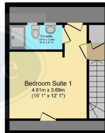
Second Floor Floor area 23.4 m 2 (252 sq.ft.)