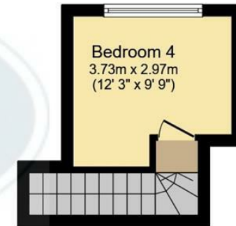
Second Floor Floor area 10.7 m 2 (115 sq.ft.)