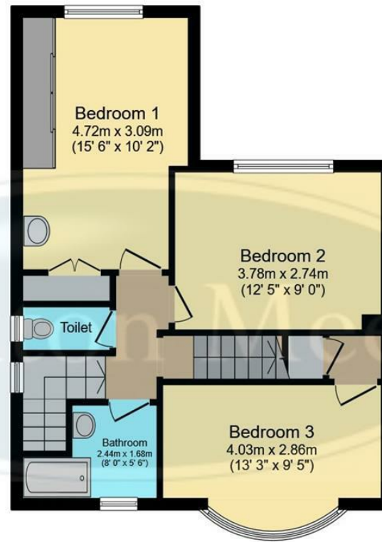
First Floor Floor area 48.9 m 2 (526 sq.ft.)