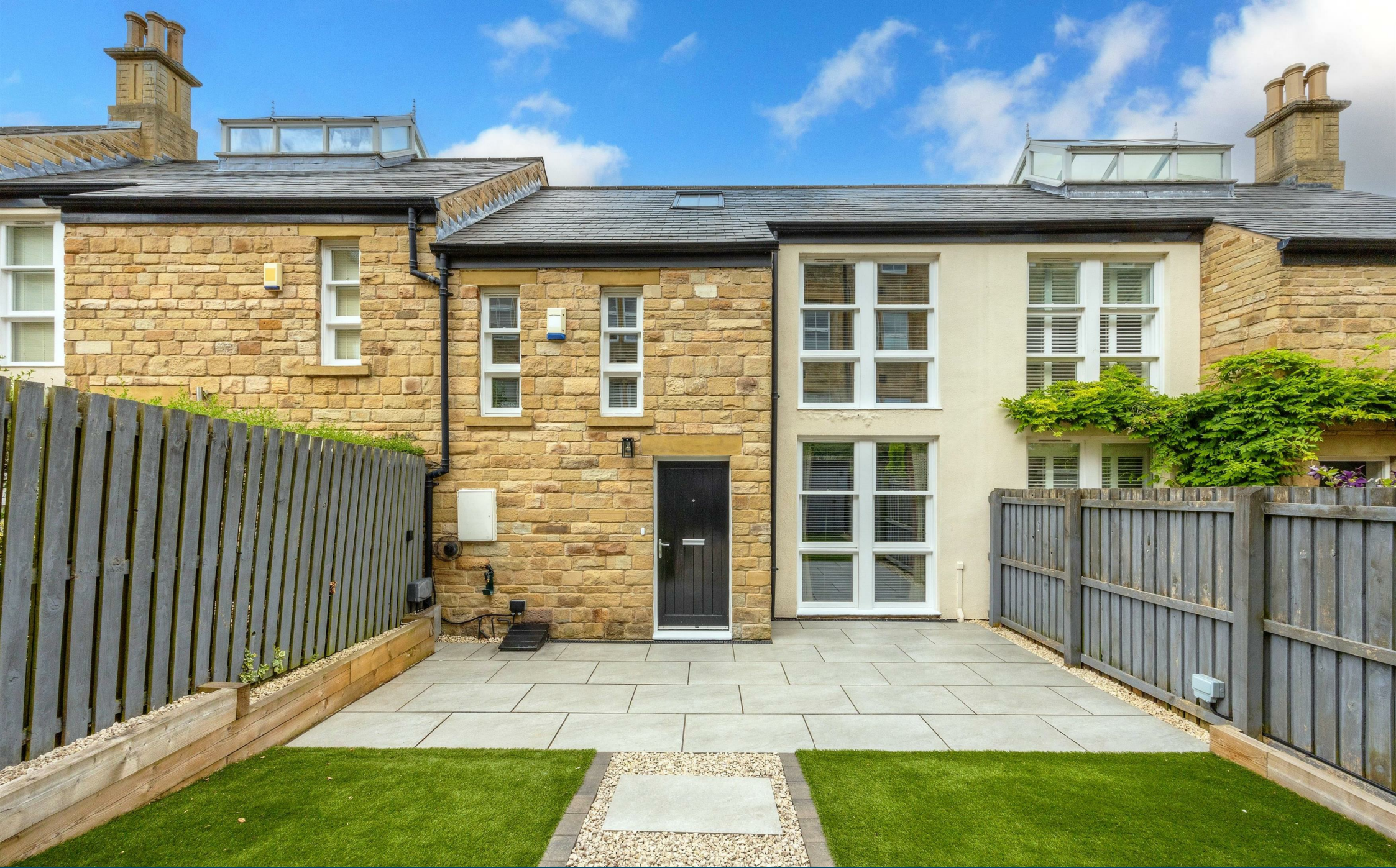
8 Osborne Walk, Nether Edge, Sheffield, S11 9EP