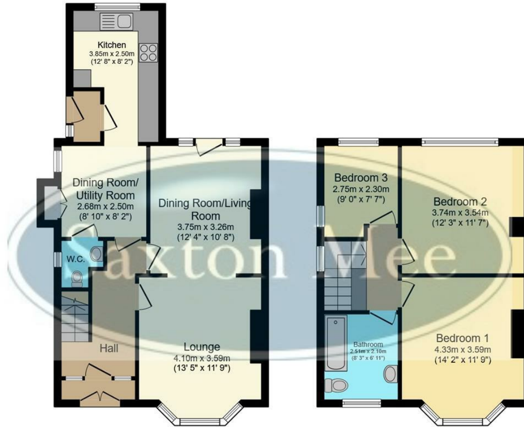
Ground Floor Floor area 55.0 m 2 (592 sq.ft.)