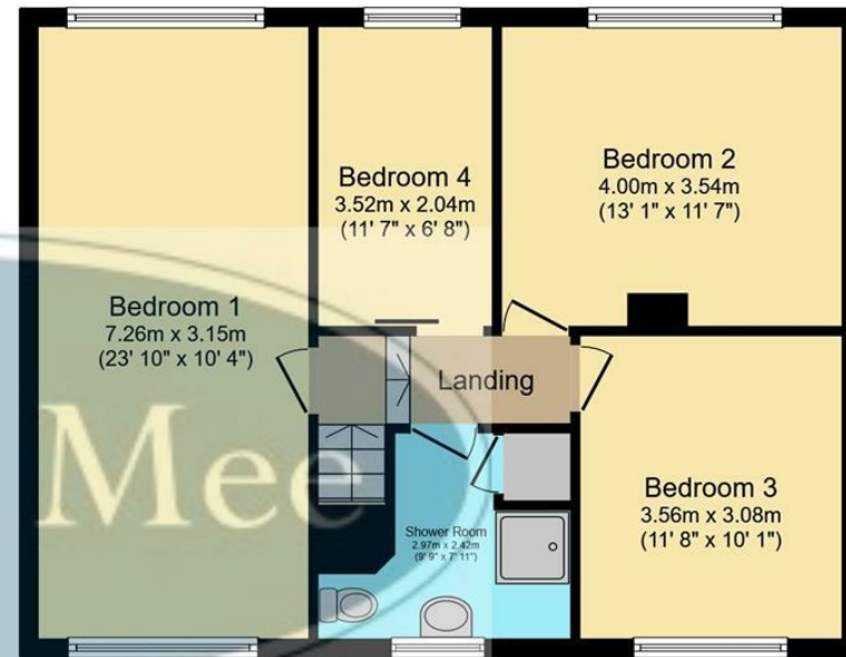
First Floor Floor area 67.7 m 2 (729 sq.ft.)