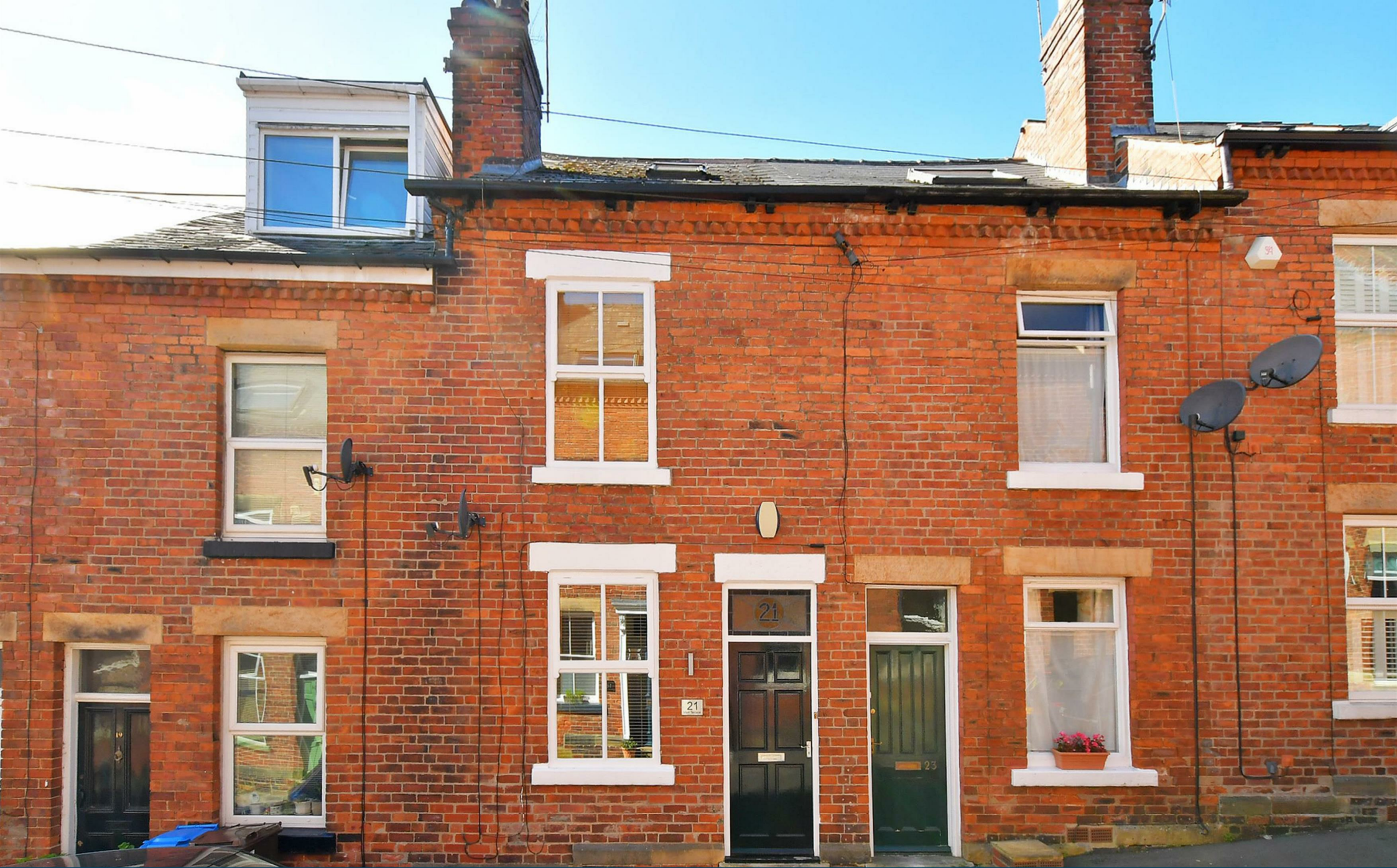
21 Marr Terrace, Ranmoor, Sheffield, S10 3GL