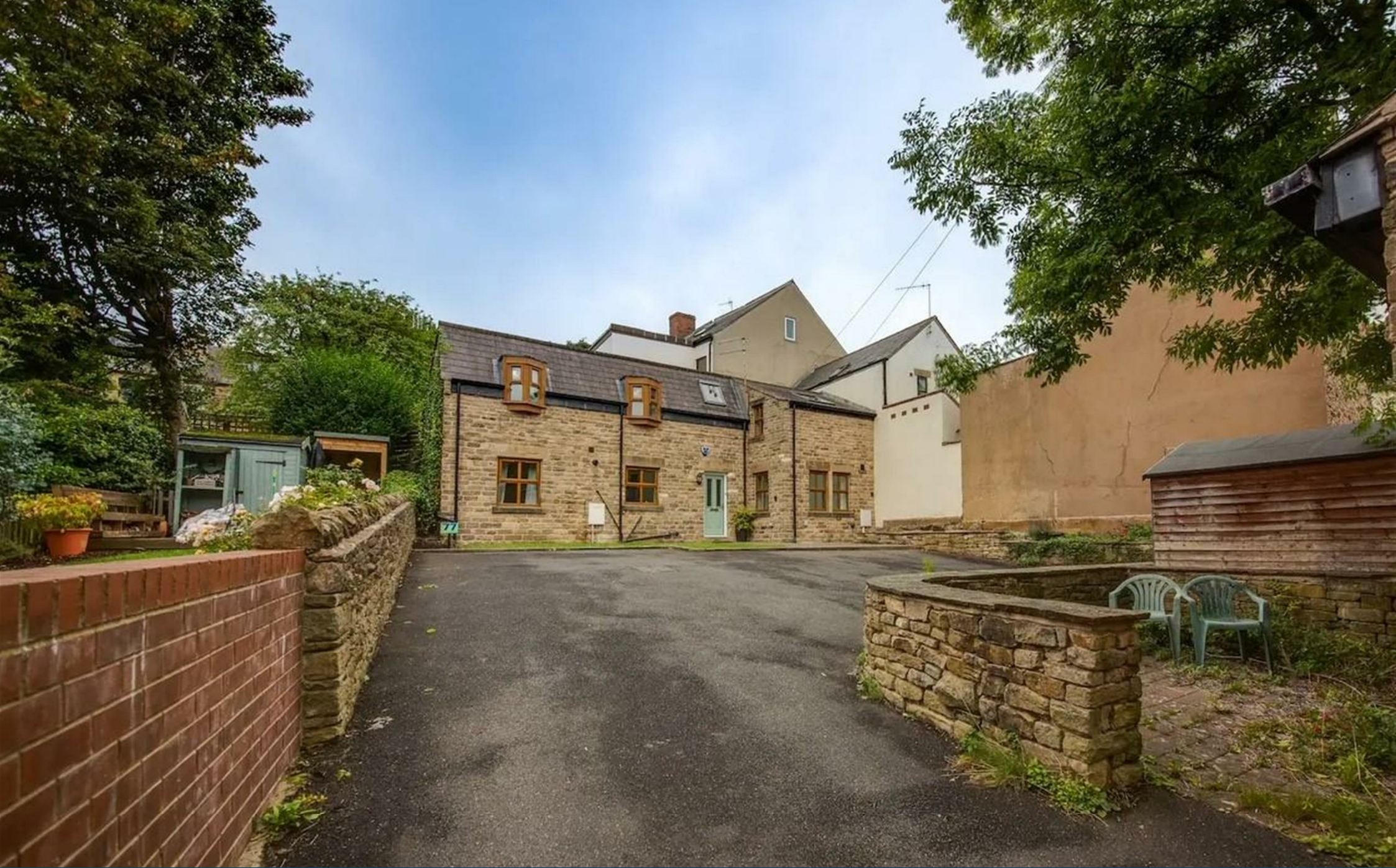
The Coach House, 77 Brighton Terrace Road, Crookes, Sheffield, S10 1NT