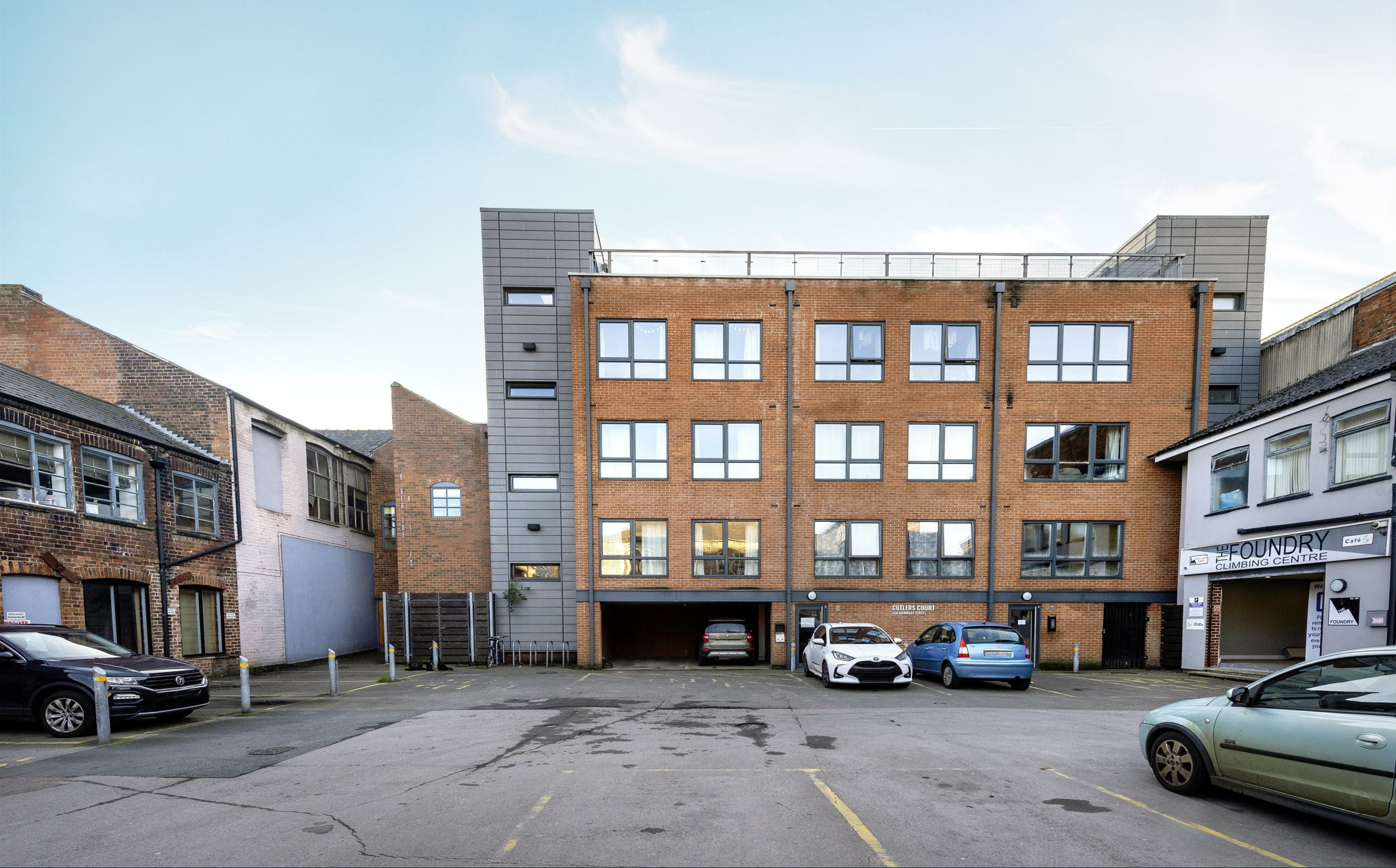
19 Cutlers House 45A Mowbray Street, Sheffield, S3 8ES