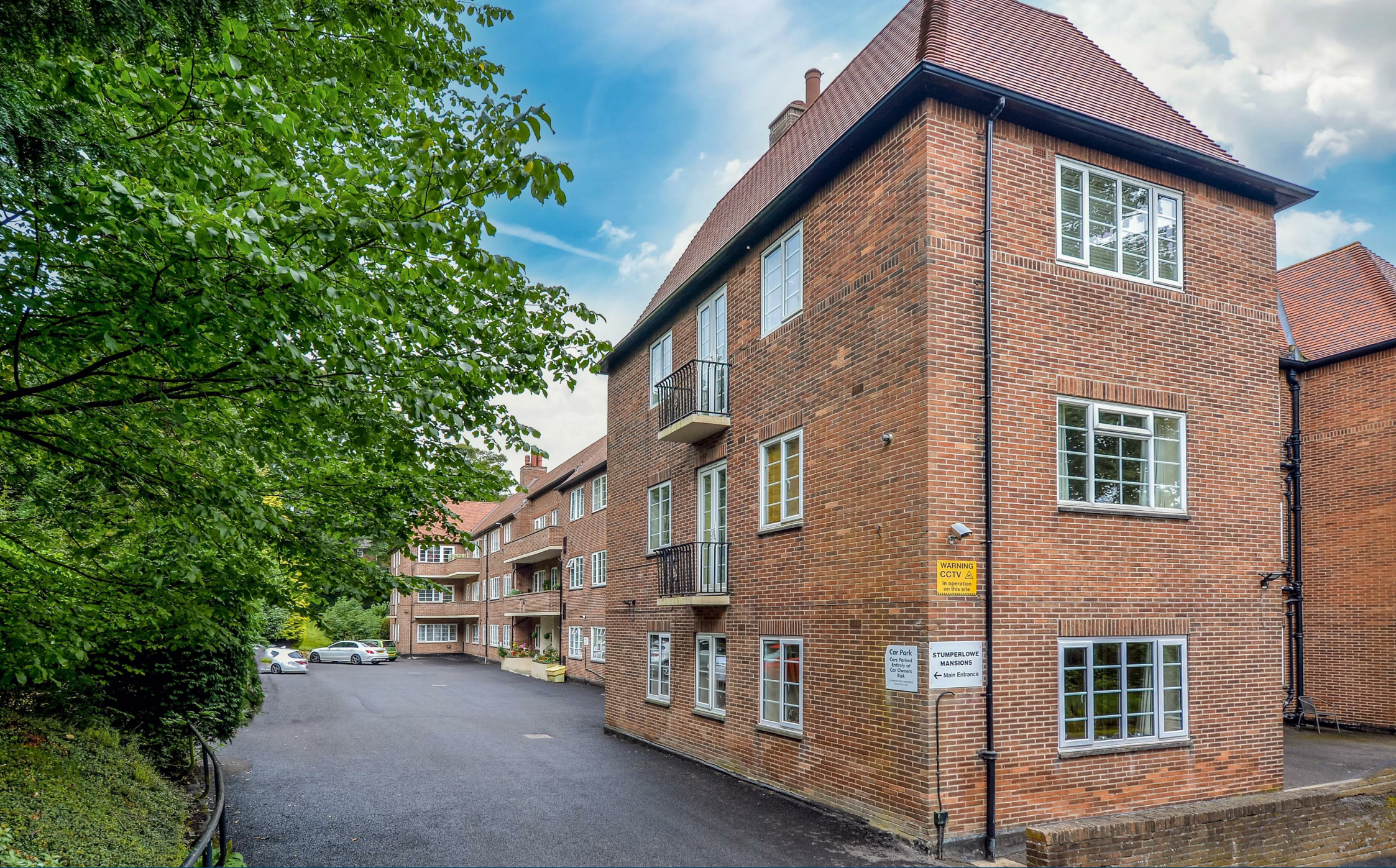
4 Stumperlowe Mansions Stumperlowe Lane, Fulwood, Sheffield, South