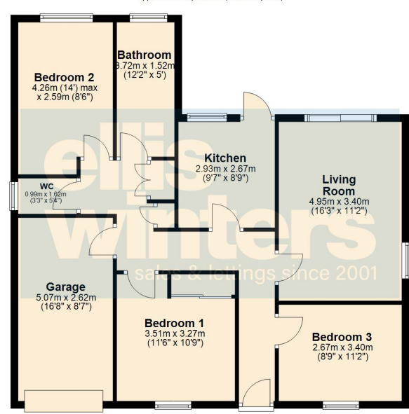
Total area: approx. 93.4 sq. metres (1005.5 sq. feet)