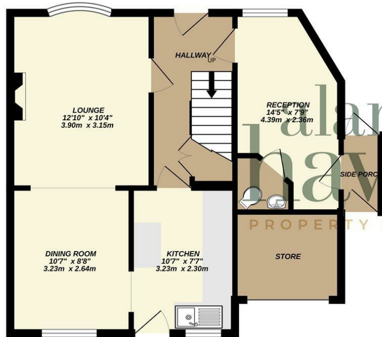
GROUND FLOOR 552 sq.ft. (51.3 sq.m.) approx.