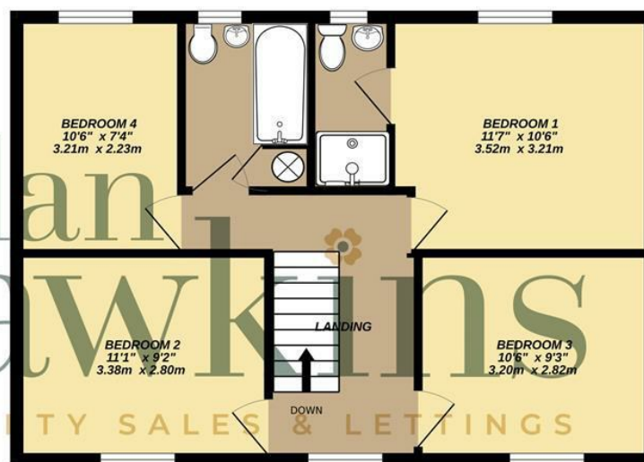
1ST FLOOR 556 sq.ft. (51.6 sq.m.) approx.