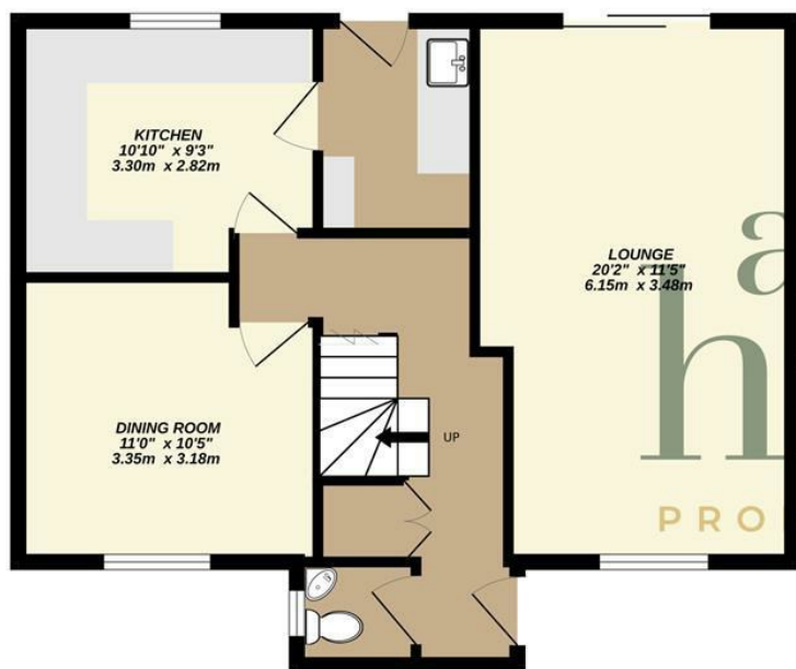
GROUND FLOOR 586 sq.ft. (54.4 sq.m.) approx.