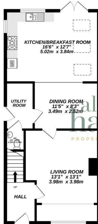
GROUND FLOOR 608 sq.ft. (56.5 sq.m.) approx.