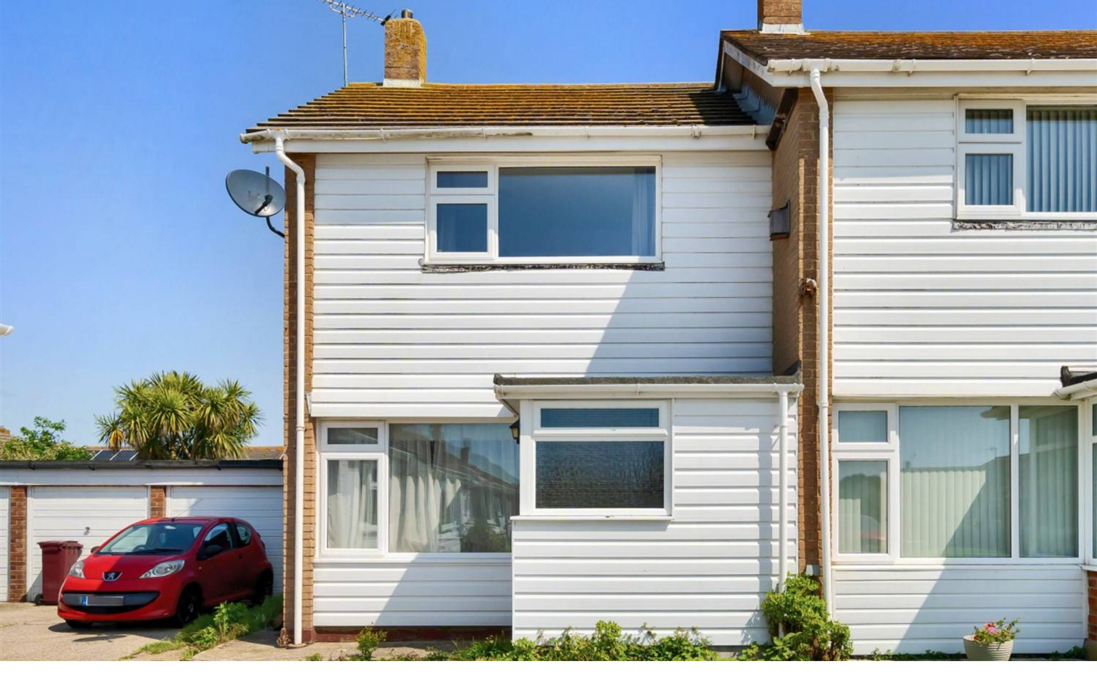
5 Romney Garth, Selsey Guide Price £270,000