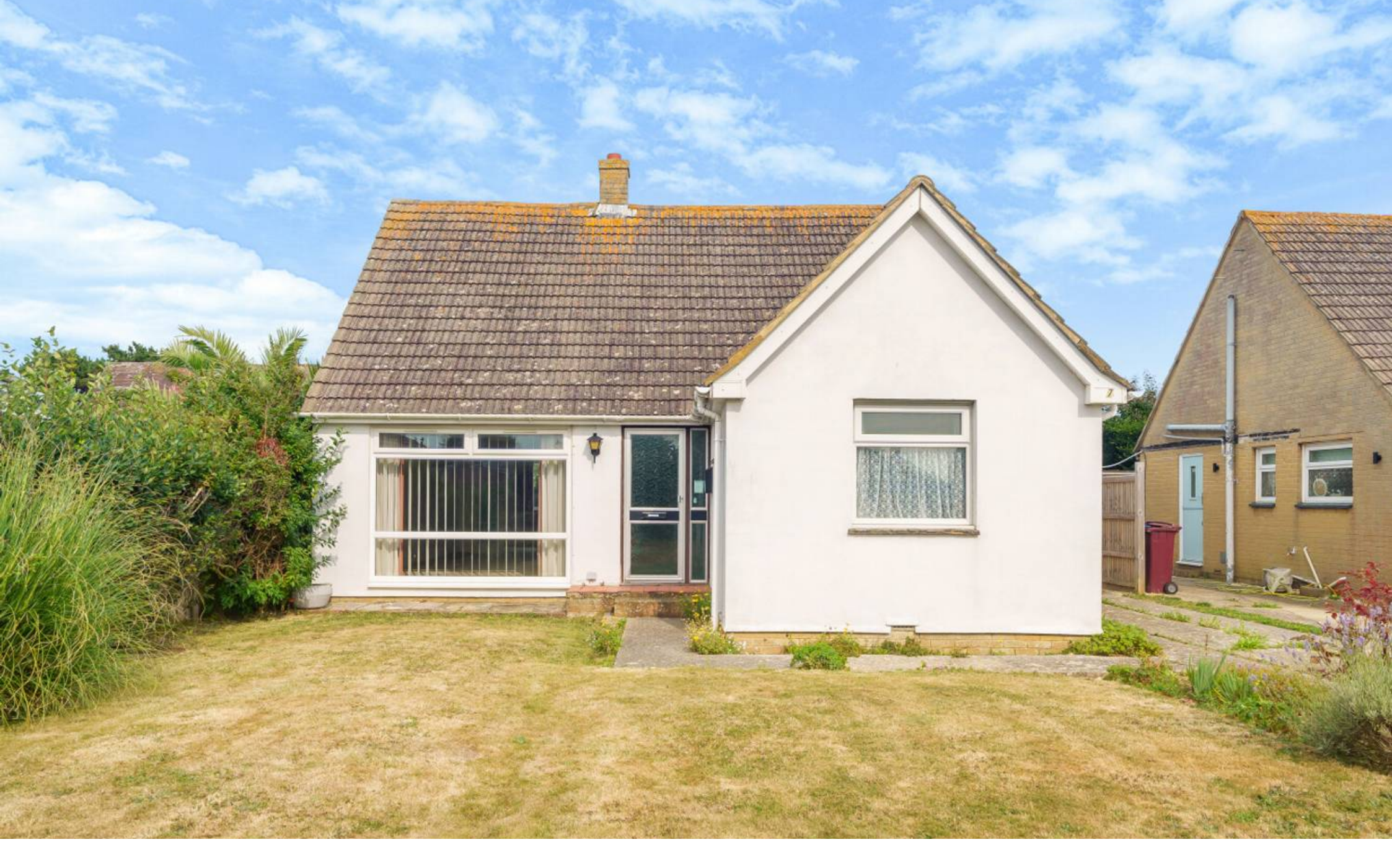
7 Sunnymead Close, Selsey Guide Price £425,000 Freehold