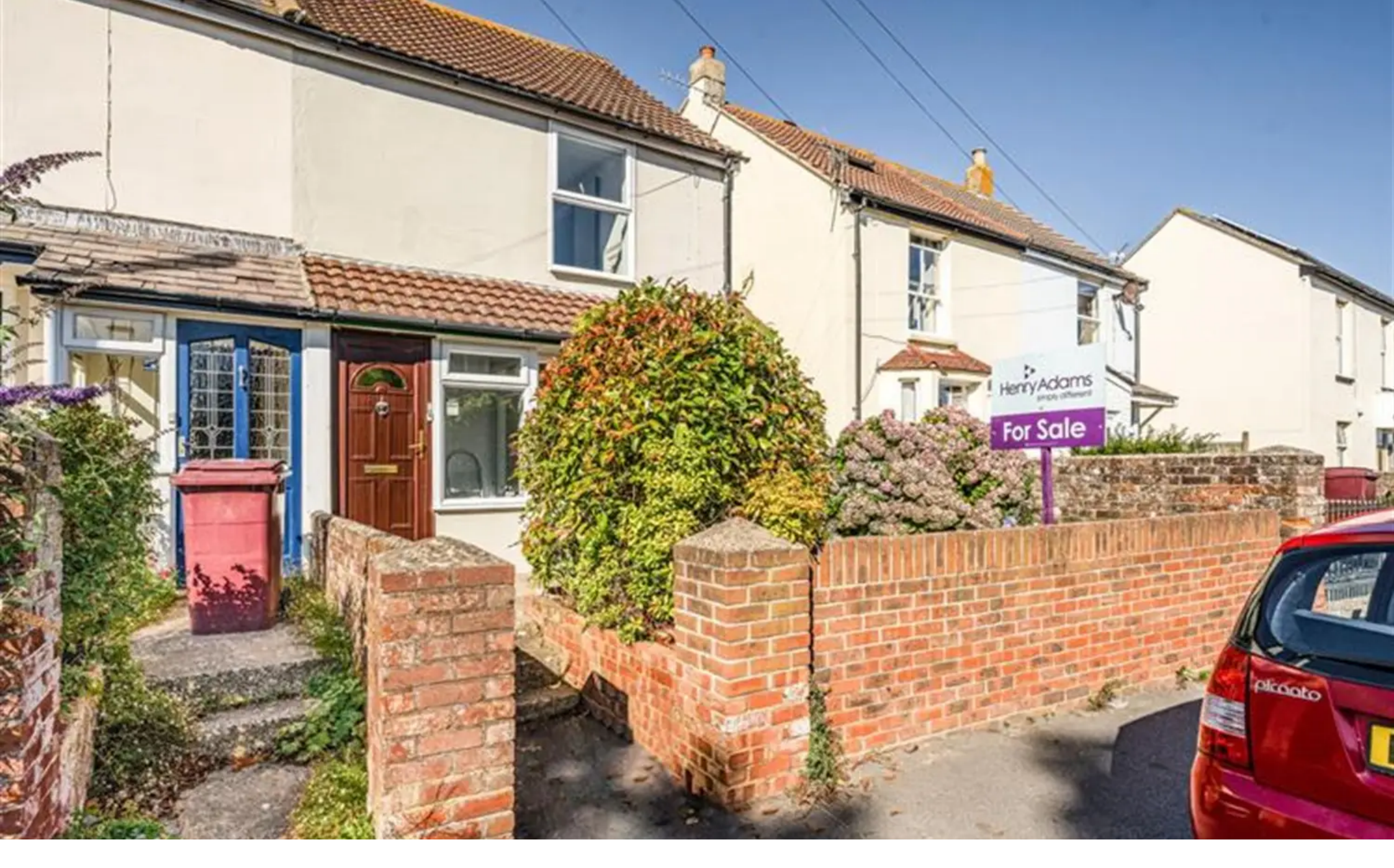
49 East Street, Selsey Guide Price £310,000