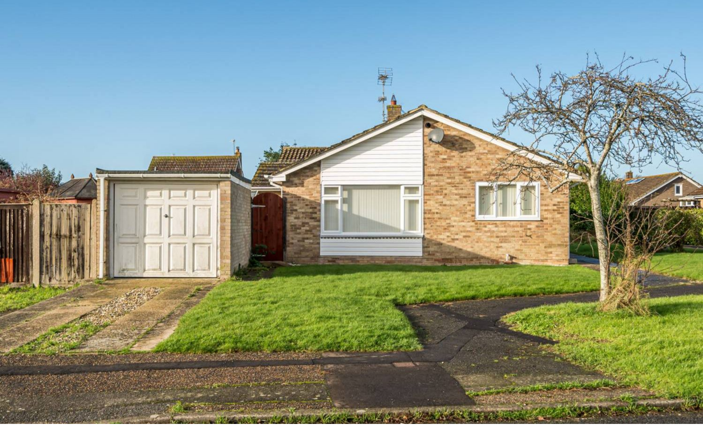
24 Andrew Avenue, Felpham In Excess of £385,000