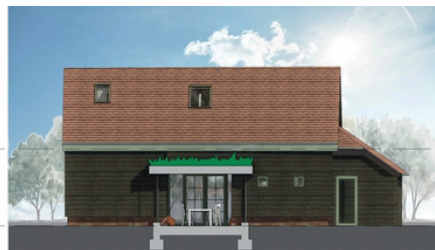
E INNER ELEVATION 1 1: 100