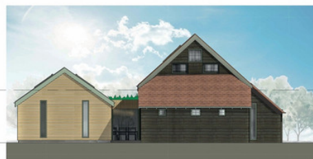
A SIDE ELEVATION 1: 100