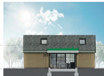
F INNER ELEVATION 2 1: 100