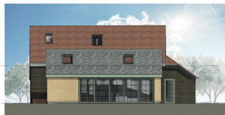
B REAR ELEVATION 1: 100