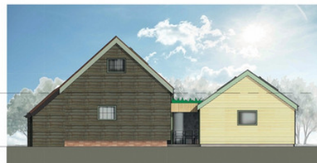
C SIDE ELEVATION 2 1: 100