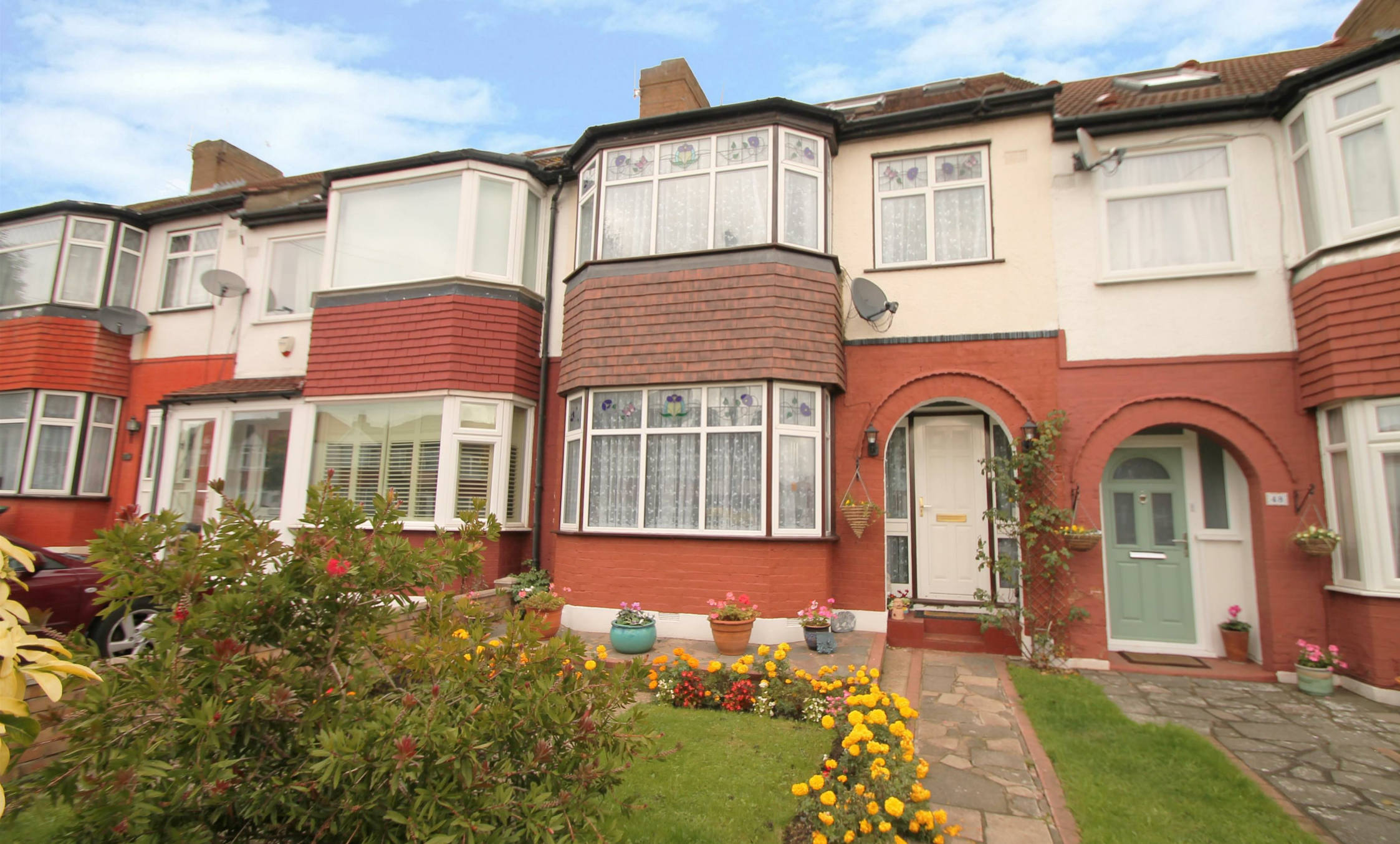
The Fairway, Palmers Green, London, N13 £529,995 Freehold