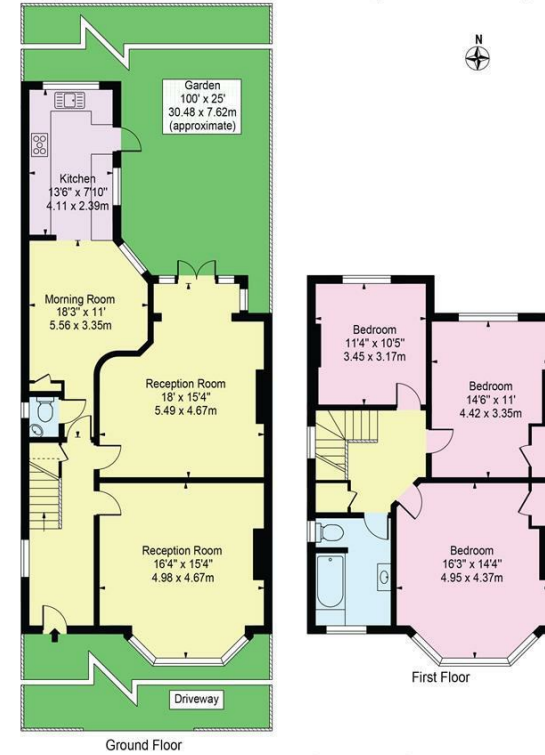
Ground Floor For Illustration Purposes Only - Not To Scale

Ulleswater Road Approx. Gross Internal Area 1532 Sq Ft - 142.33 Sq M