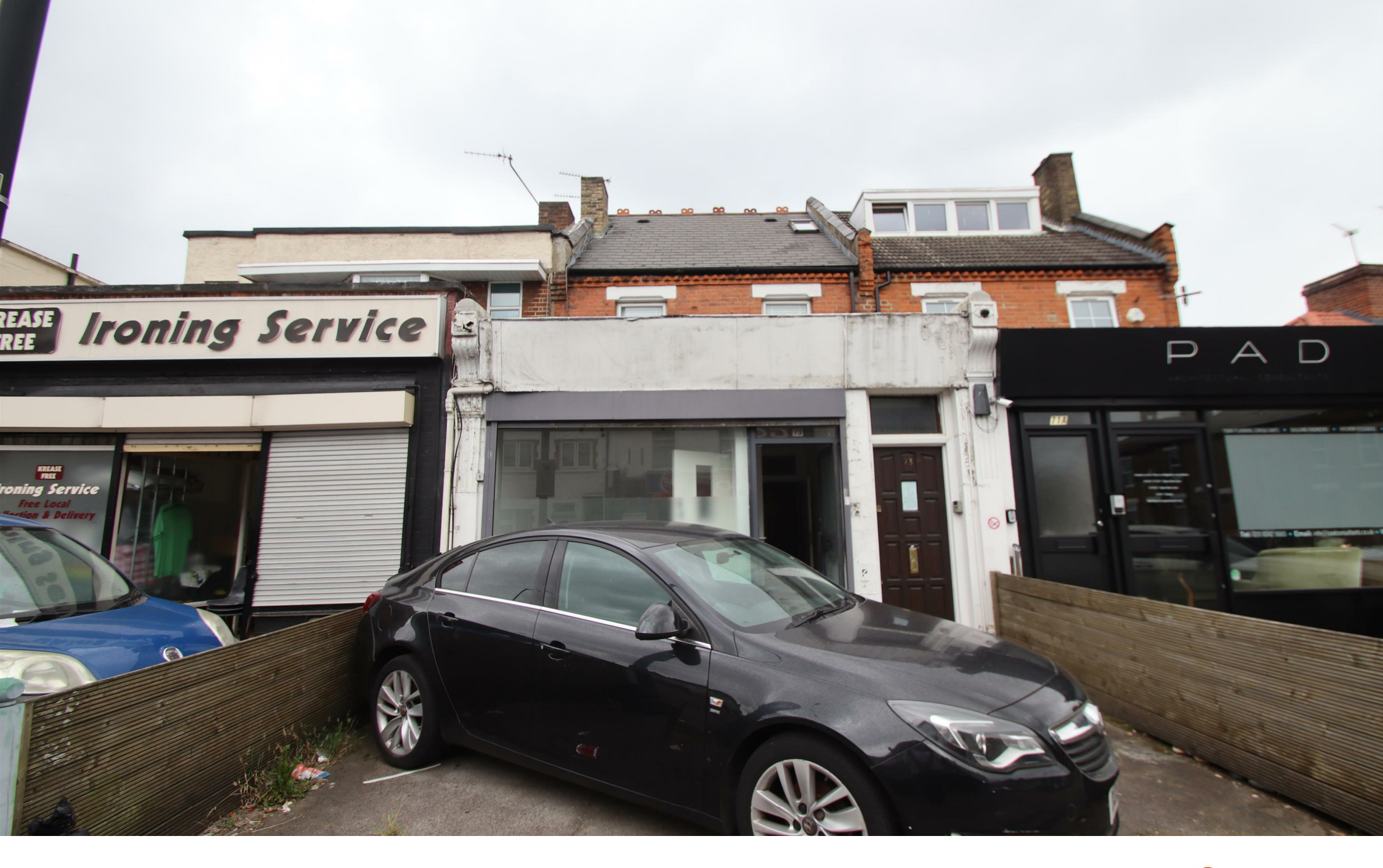
St. Marks Road, Bush Hill Park, Enfield, EN1 Chain Free £300,000 Leasehold