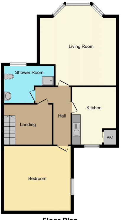
Floor Plan Floor area 89.2 sq.m. (960 sq.ft.) approx

Total floor area 89.2 sq.m. (960 sq.ft.) approx This plan is for illustration purposes only and may not be representative of the property. Plan not to scale.