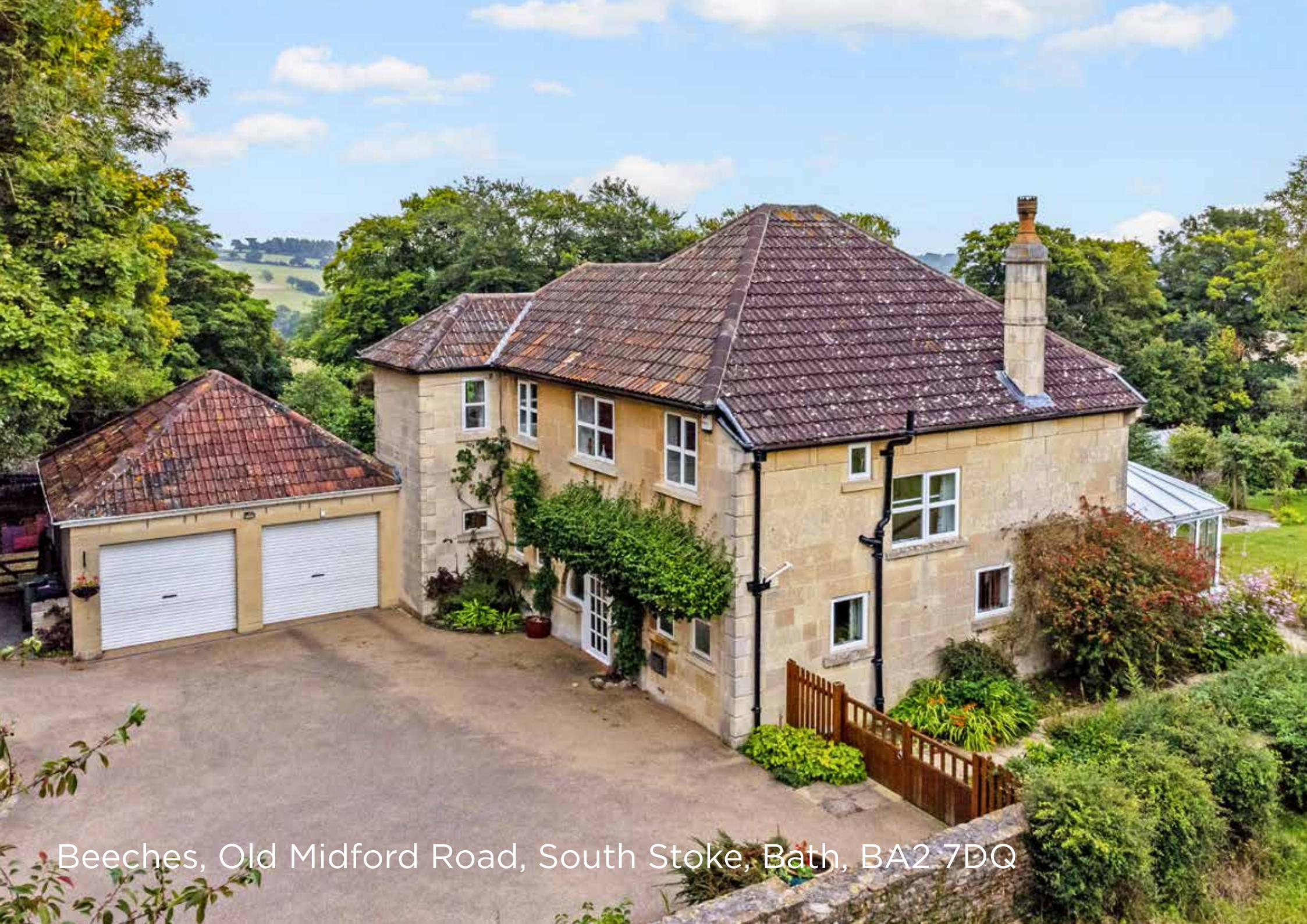
Beeches, Old Midford Road, South Stoke, Bath, BA2 7DQ