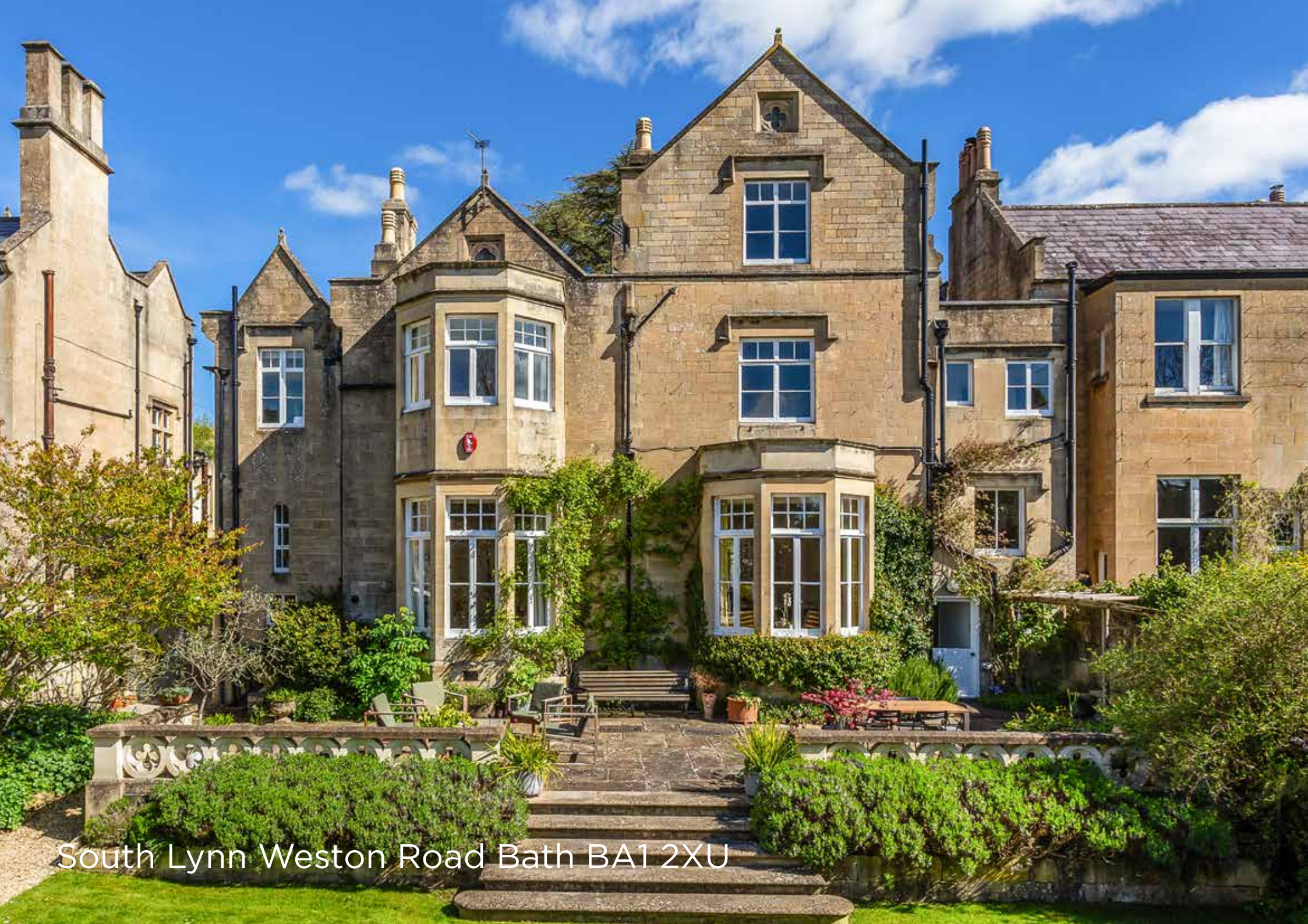
South Lynn Weston Road Bath BA1 2XU