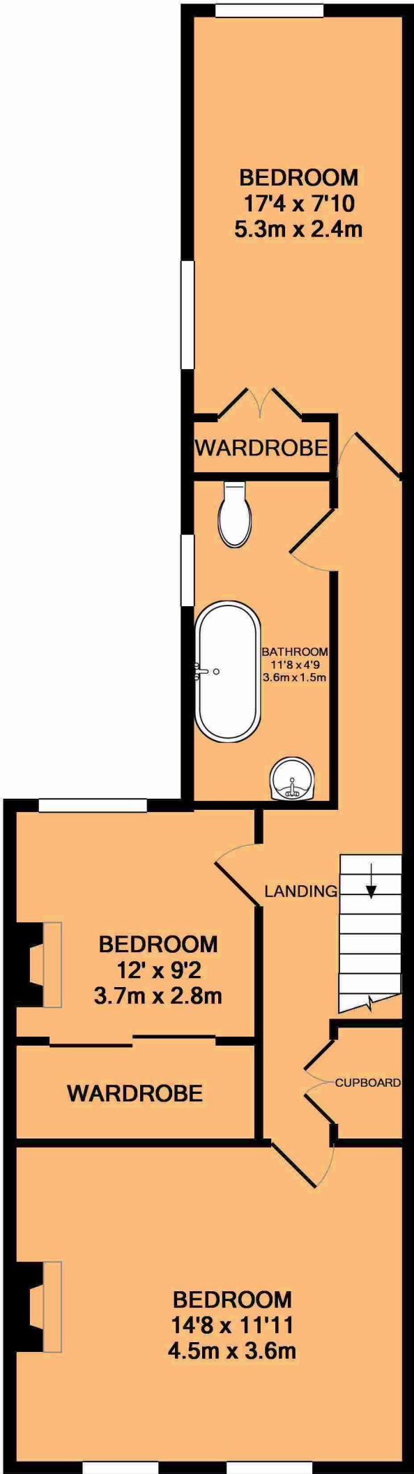
1ST FLOOR APPROX. FLOOR AREA 595 SQ.FT. (55.2 SQ.M.)

TOTAL APPROX. FLOOR AREA 1370 SQ.FT. (127.2 SQ.M.)