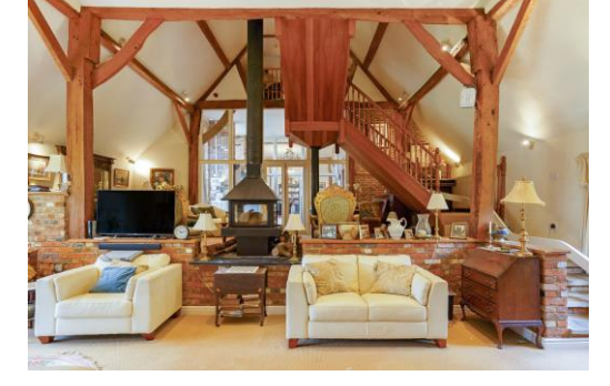
Reception Hall Floor to ceiling glass panels. Tiled floor.