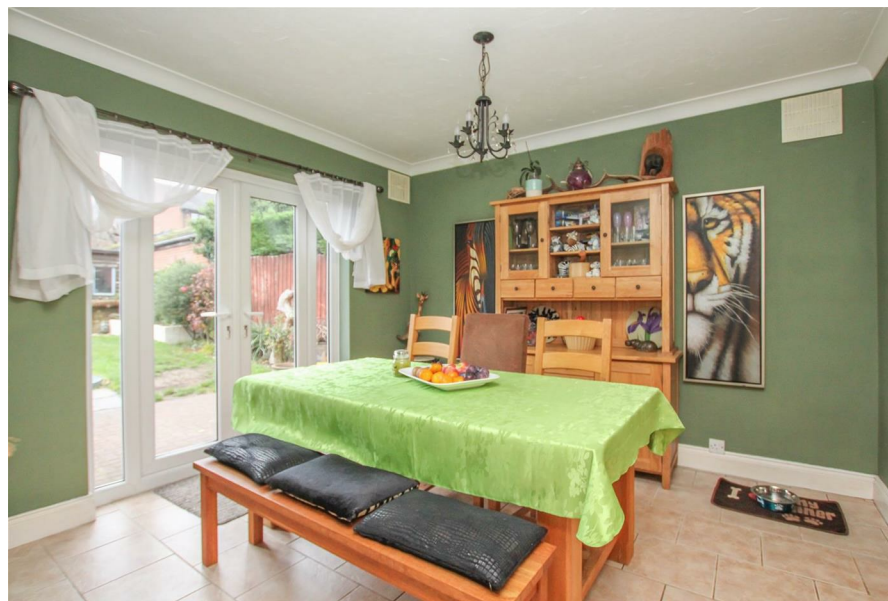
65 Broomwood Gardens, Pilgrims Hatch, Brentwood, CM15 9LH

**Guide Price - £375,000 - £400,000** Located within the popular area of Pilgrims Hatch is this deceptively spacious, two double bedroom, end-of-terrace property. Ideally situated in the Larchwood School catchment area, the property offers significant potential to extend subject to planning permission.