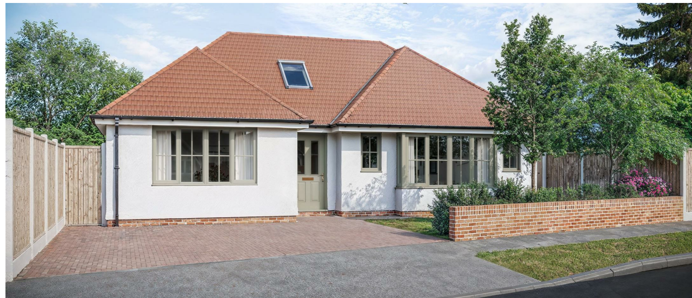
Building Plot Oliver Road, Shenfield, Brentwood, CMI5 8PX

Nestled in the sought-after area of Shenfield, Brentwood, this prime plot of land offers an exceptional opportunity for a family bungalow in a desirable setting. The planning application is currently pending approval for a thoughtfully designed bungalow that combines modern living with practical functionality. The proposed design features 3 double bedrooms (with an ensuite to the master) an open-plan living/kitchen/dining room and a family bathroom. There is a well proportioned rear garden and off street parking to the front. Shenfield is renowned for its excellent schools, and convenient transport links, including Shenfield railway station, which provides direct services to London Liverpool Street,