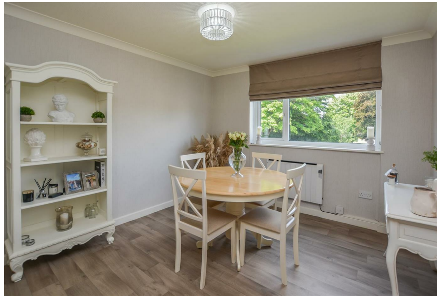
Thorndon Court Eagle Way, Great Warley, Brentwood, CM13 3BZ

TOTAL FLOOR AREA: 733 sq.ft. (68.1 sq.m.) approx. Measurements are approximate. Not to scale. Boundary shown only. Made with Mapbox (2022)