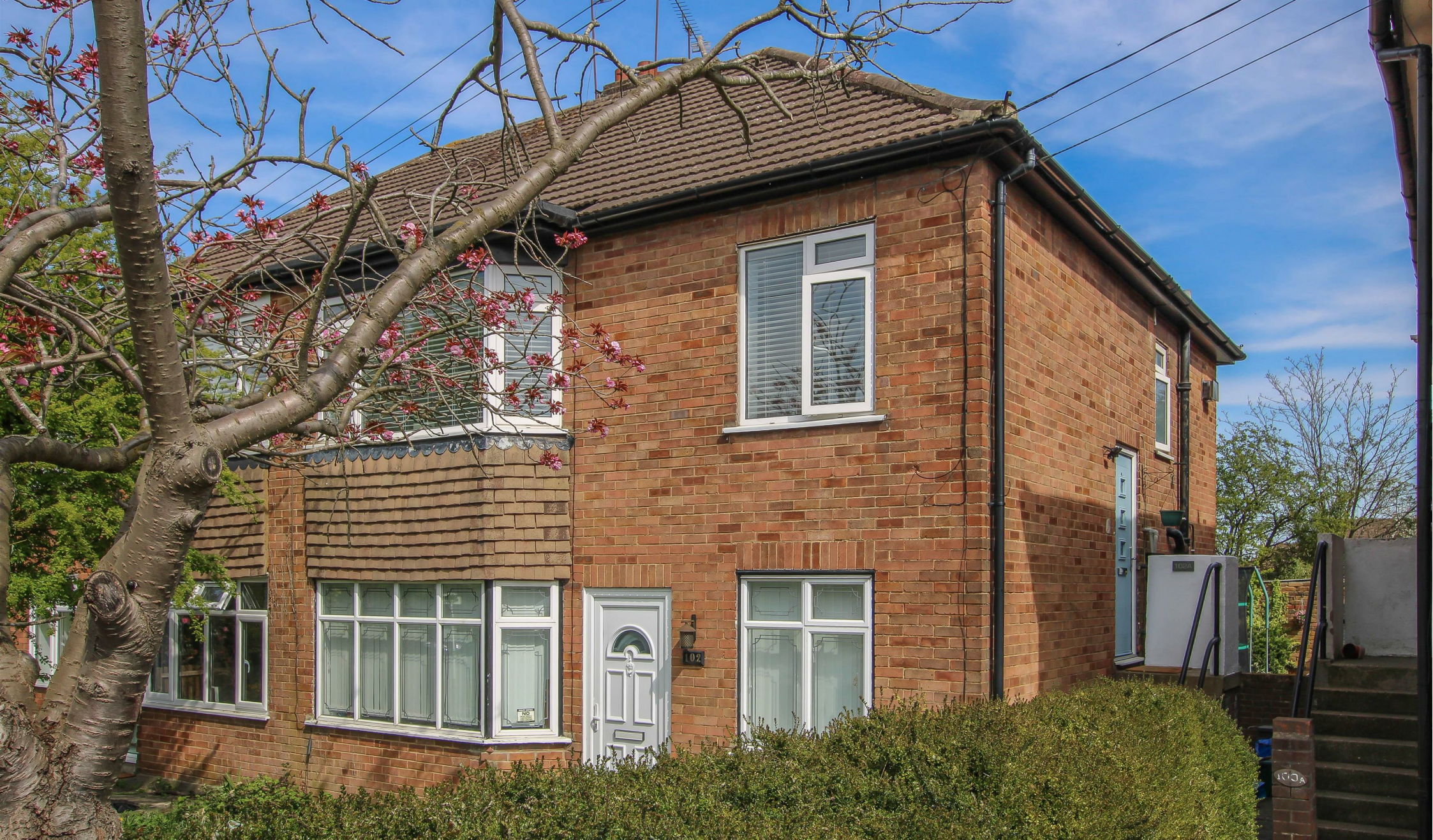
Keith Ashton Doddinghurst Road, Brentwood