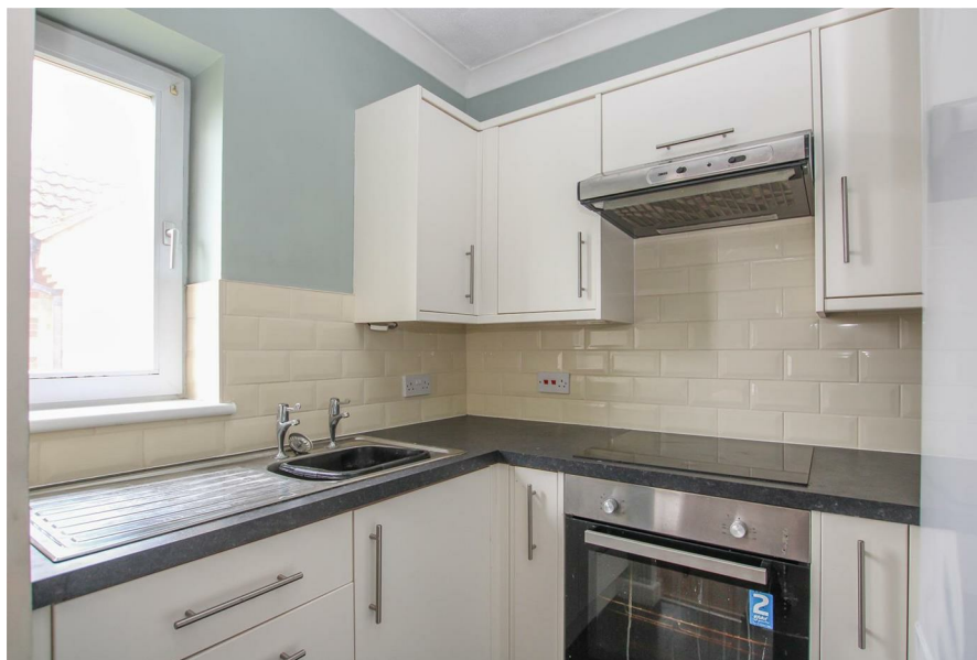
59 Homehurst House Sawyers Hall Lane, Brentwood, CM15 9BU

TOTAL FLOOR AREA: 463 sq.ft. (43.0 sq.m.) approx. Measurements are approximate. Not to scale. Boundary is approximate. Based on 10/10/2024