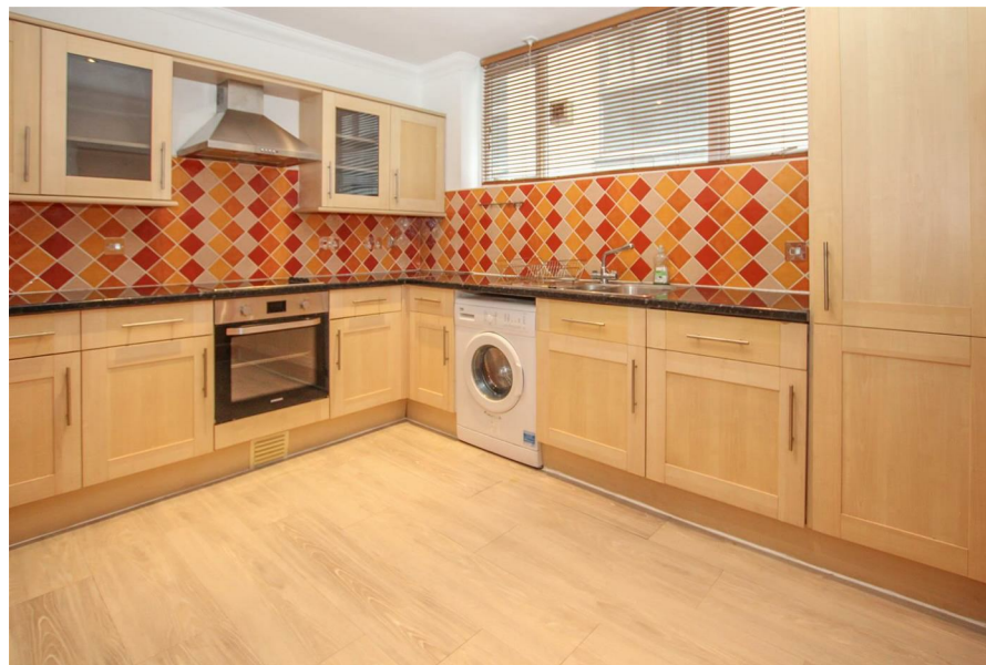
Flat 5 Crown House 1-3 Crown Street, Brentwood, CM14 4AZ

TOTAL APPROX. FLOOR AREA 647 SQ.FT. (60.1 SQ.M.) THIS PLAN IS FOR ROOM IDENTIFICATION ONLY, AND ITS ACCURACY IS NOT GUARANTEED. www.epcsinessex.co.uk Made with Metropix ©2018