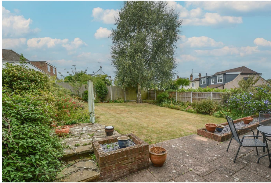
20 Belvedere Road, Brentwood, CM14 4PZ

Offered with no onward chain come this spacious detached property that offers bundles of potential for modernisation and extension. The garden boasts a south facing rear garden that is mostly lawned with gated side access to the front on both flanks. The house sits in a most sought after area with superb road links close by. More importantly for families, it is also located within the catchment area for St Peters School which is incredibly well regarded. The plot commences with a private driveway allowing off street parking as well as access into the attached garage.