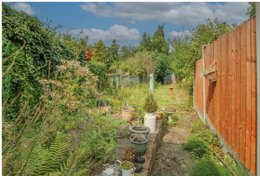
19 Cromwell Road, Warley, Brentwood, CM14 5DT

** GUIDE RANGE £375,000 - £400,000 ** NO ONWARD CHAIN - This charming two/three bed cottage boasts a welcoming porch that leads to the cosy living room with a fireplace to centre, a dining room through to the well equipped kitchen and a family bathroom. To the first floor there are 3 bedrooms, two of which are double rooms and a third single. Requiring some modernisation throughout, this property presents a fantastic opportunity to add a personal touch and with the excellent size plot, it offers plenty of scope to extend, subject to planning permission. Externally the property offers off road parking to the front and a sizable garden to the rear.