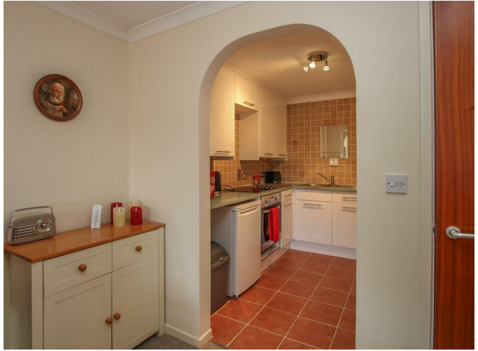
42 PRIMROSE COURT KINGS ROAD Brentwood, CM14 4YZ