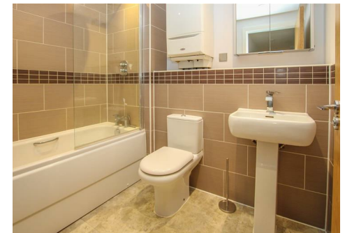
Craven Gate 4 Lorne Road, Warley, Brentwood, CM14 5HH

Set in a quiet cul-de-sac position within the sought after Warley area, Craven Gate is a fine development of nine luxury apartments, finished to a high standard throughout. The area is very popular due to the proximity of Brentwood station, offering its fast links into London, and beyond with the new Elizabeth Line, which you will find within a short walk. Along the way there are many local shops and services, plus a couple of bars, or should you require the busy high street, with its multitude of options for shopping and socialising then that is positioned approximately one mile away. There are many local gyms, clubs and classes nearby or for outdoor exercise there are a couple of local parks and woodlands close to hand for you take a quiet stroll.