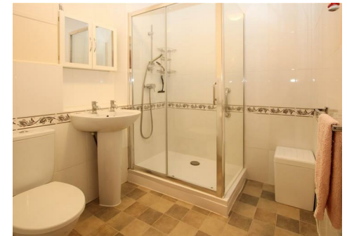
39 Ravenscourt, Sawyers Hall Lane, Brentwood, CM15 9BE

GUIDE PRICE £260,000 - £270,000. We are pleased to offer for sale this well presented two-bedroom, top floor retirement apartment, suitable for the over 55's, which is being offered with no onward chain and a share of freehold. Set in a fantastic position within a sought-after retirement development and conveniently located on Sawyers Hall Lane offering a short walk to Brentwood High Street. Residents' facilities include lifts to all floors, a laundry room, a communal lounge and conservatory. It is surrounded by well-kept gardens and residents' parking is also available via electronically operated security gates. The internal accommodation commences with a spacious reception room, modern through kitchen, that boasts a good selection of eye and base level units, ample worktop space and integrated appliances. There is a great deal of natural light from the French doors in the reception room giving access to a Juliet balcony. Both bedrooms are sizable doubles with built-in wardrobes whilst the shower room, fitted with a modern white suite, comprising a large walk in shower, pedestal wash hand basin and close coupled WC completes the internal layout.