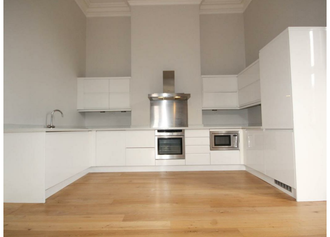
15 THE CLOCK TOWER THE GALLERIES