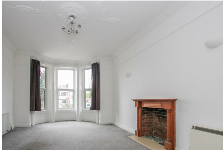
56b London Road, Brentwood, CM14 4NJ

TOTAL FLOOR AREA: 634 sq ft (58.9 sq m) approx. Measurements are approximate. Not to scale. Excludes porches only. View on keithashton.co.uk