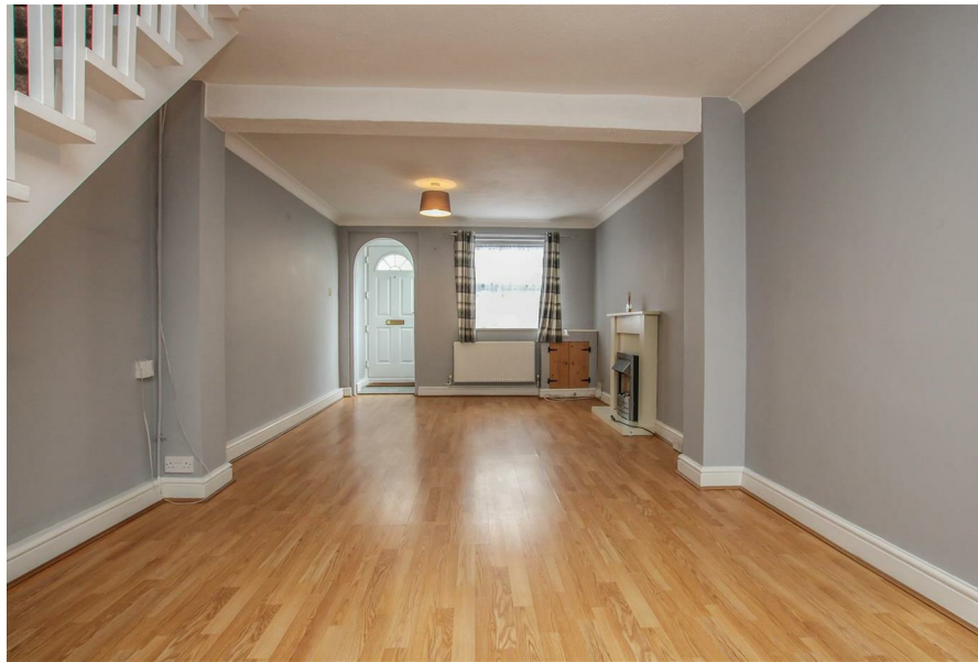
40 Alfred Road, Brentwood, CM14 4BT

THIS PLAN IS FOR ROOM IDENTIFICATION ONLY, AND ITS ACCURACY IS NOT GUARANTEED. www.epcsinsex.co.uk Made with Metropix ©2018