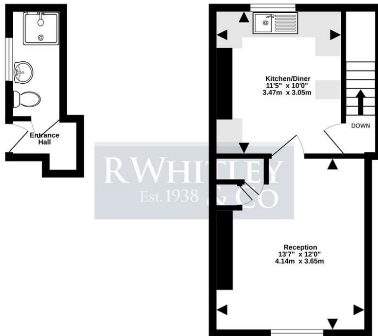
TOTAL FLOOR AREA: 346 sq.ft. (32.2 sq.m.) approx.

Whilst every attempt has been made to ensure the accuracy of the floorplan contained here, measurements of doors, windows, rooms and any other items are approximate and no responsibility is taken for any error, omission or mis-statement. This plan is for illustrative purposes only and should be used as such by any prospective purchaser. The services, systems and appliances shown have not been tested and no guarantee as to their operability or efficiency can be given. Made with Metropix ©2024