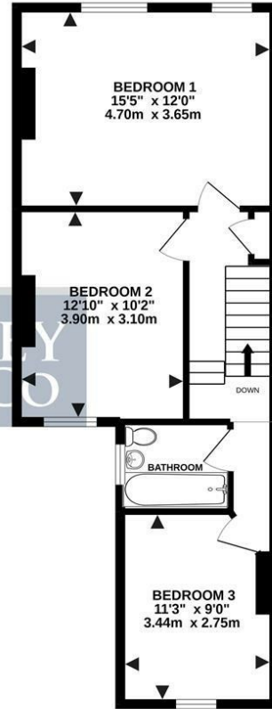
1ST FLOOR 526 sq.ft. (48.9 sq.m.) approx.