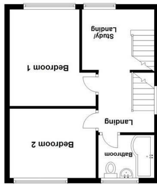
First Floor Approx. 37.4 sq. metres (402.3 sq. feet)