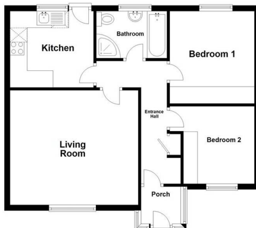
Total area: approx. 58.8 sq. metres (632.5 sq. feet)

Whilst every attempt has been made to ensure the accuracy of this floorplan, all measurements are approximate and no responsibility is taken for any error, omission or mis-statement. This plan and its measurements are for illustrative purposes only. Plan produced using PlanUp.