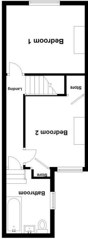
First Floor Approx. 33.1 sq. metres (355.9 sq. feet)

Total area: approx. 66.1 sq. metres (711.8 sq. feet) Whilst every attempt has been made to ensure the accuracy of this plan and its measurements are for illustrative purposes only, all measurements are approximate and no responsibility is taken for any error, omission or mis-statement. This plan and its measurements are for illustrative purposes only. Plan produced using Planlup.